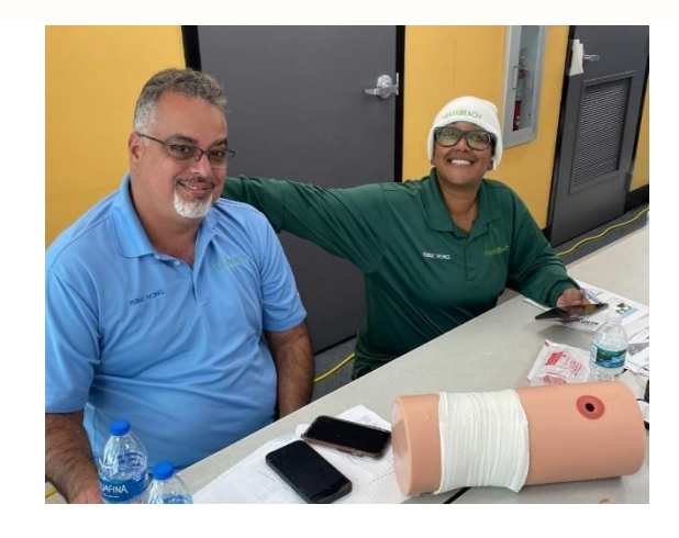
<u>What's New in City CERT...</u> Welcome to the City of Miami Beach CERT newsletter!