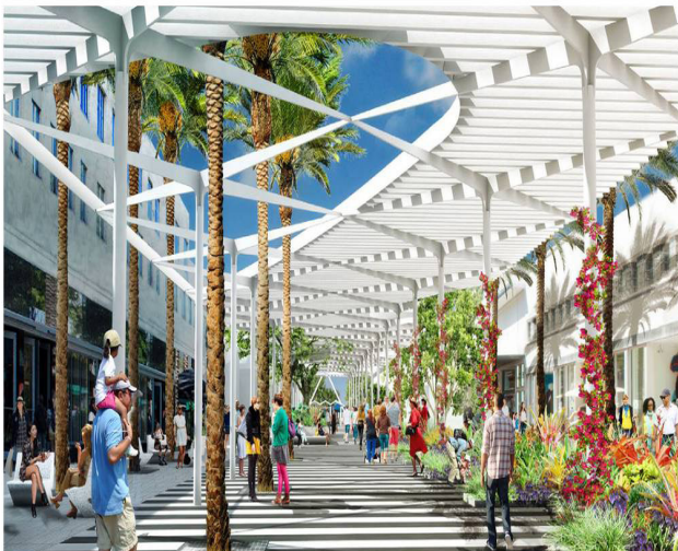
THE BEACH GATEWAY | 400 BLOCK PROPOSED