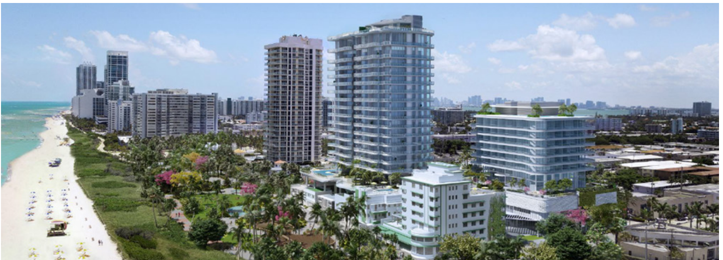
Ocean Terrace Proposed Rendering