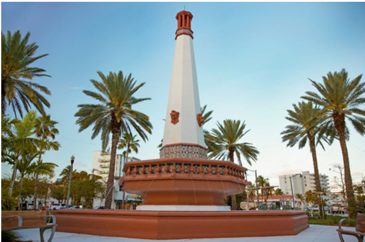
Normandy Fountain Rue Vendome Plaza Ribbon-cutting February 27, 2022