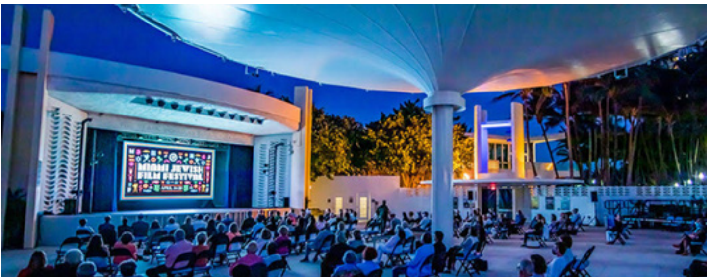
Miami Beach Bandshell