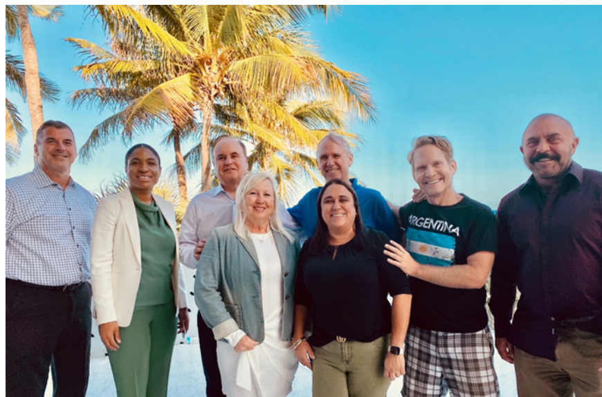
North Beach CRA Advisory Committee members and staff liaisons