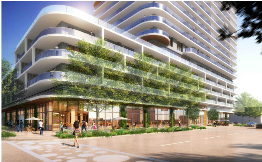
72 Park Residences

The implementation of short-term and immediate redevelopment strategies should be followed by a critical mass of development improvements in key commercial areas which are necessary to accelerate revitalization and signal progress by the North Beach CRA. These areas include Town Center, Normandy Isles/Rue Vendome Plaza, North Shore, and the West Lots. For redevelopment to occur in these parts of North Beach, CRA program initiatives must be accomplished with community participation and the leveraging of available resources. Using the Redevelopment Plan as a guide for strategies that preserve and enhance what residents value most in their neighborhoods, the North Beach CRA will work to improve on existing elements and create new elements essential for promoting a vibrant community.