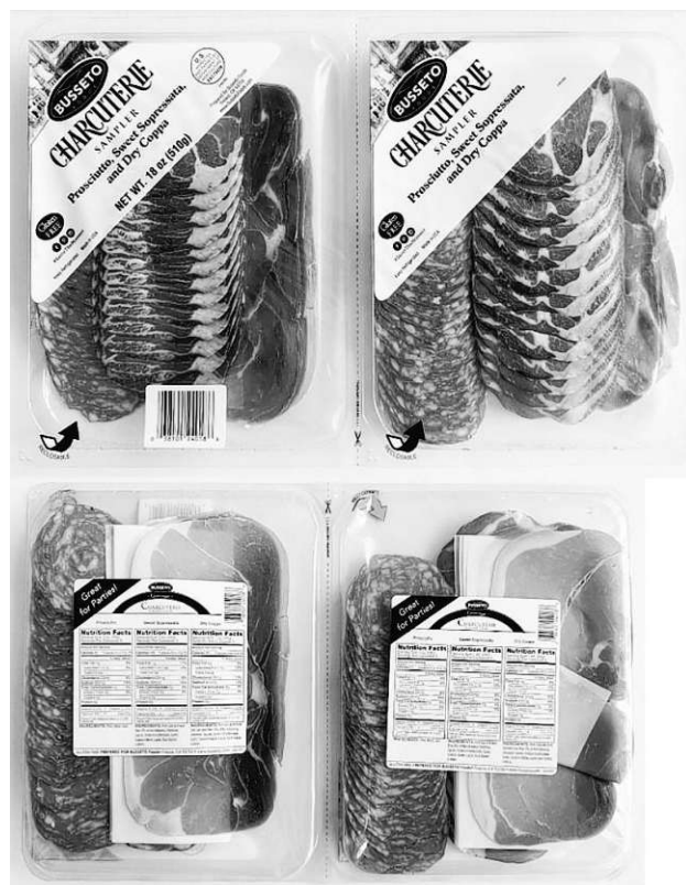
USDA-Food Safety Inspection Service

Diarrhea, stomachaches and fever usually start anywhere from six hours to